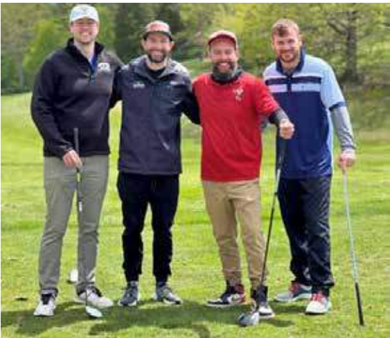
Chessie Federal Credit Union