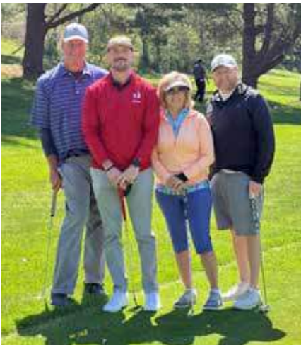
First United Bank and Trust