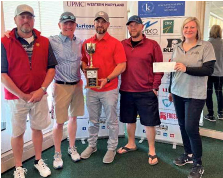
Winner of The Bell Tower Cup — ServiceMaster of Allegany County