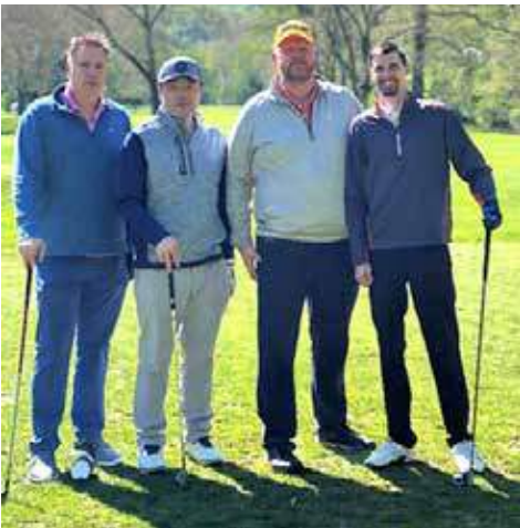
M & T Bank