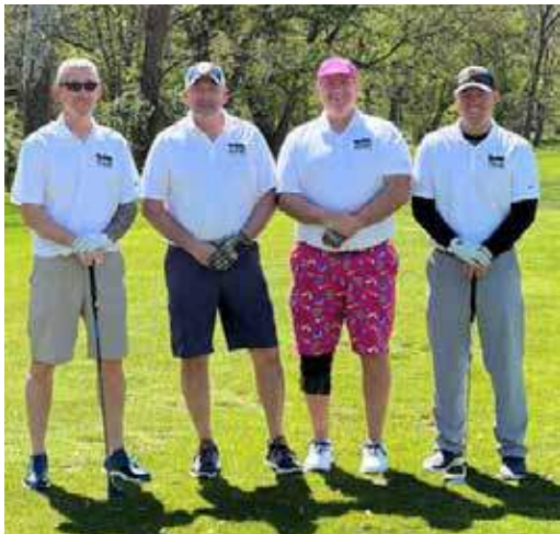
Allegany County HRDC